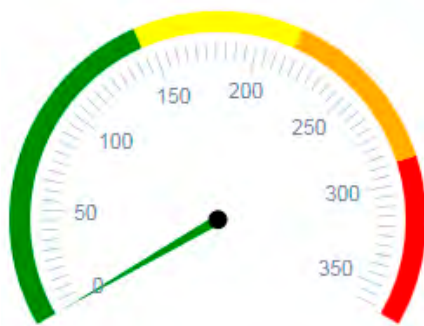
Systems In Alert (Live)