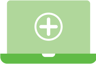
Mobile Carts and Bedside PCs