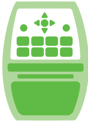
Zebra ZQ610 Portable Printer